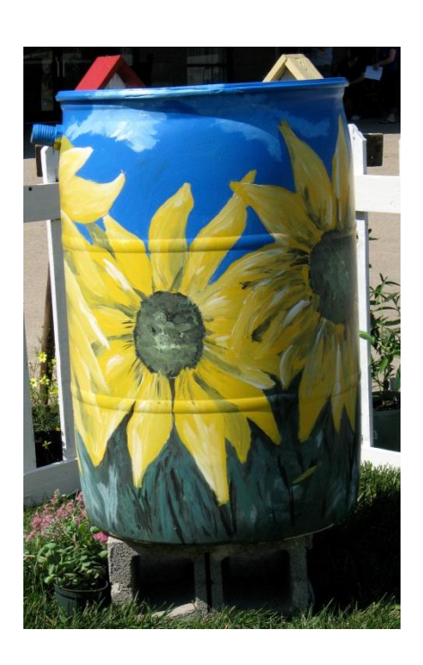
Decorate yours and make it unique