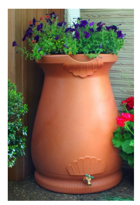
Pre-made, but you can build one inexpensively

While a rain barrel will not completely capture all stormwater runoff from your property, it is, to some degree, assisting in reducing peak runoff and volume. Additionally, it will take some time to recoup the cost of utilizing a rain barrel, but the purpose of using it is more than just saving money. Water is essentially available to us at any time on demand. However, we may experience times when we should be conserving water as much as possible. In these conditions, a rain barrel or two will certainly help in the larger picture.