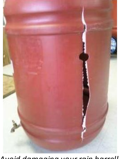
Avoid damaging your rain barrel!